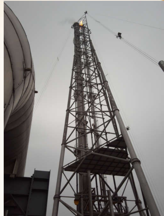
Liquid seal drum, Flare Riser and Derrick Structural for Refinery

Website: www.pps-inspection.vn Email: contact@pps-inspection.vn Phone: +84 918330685