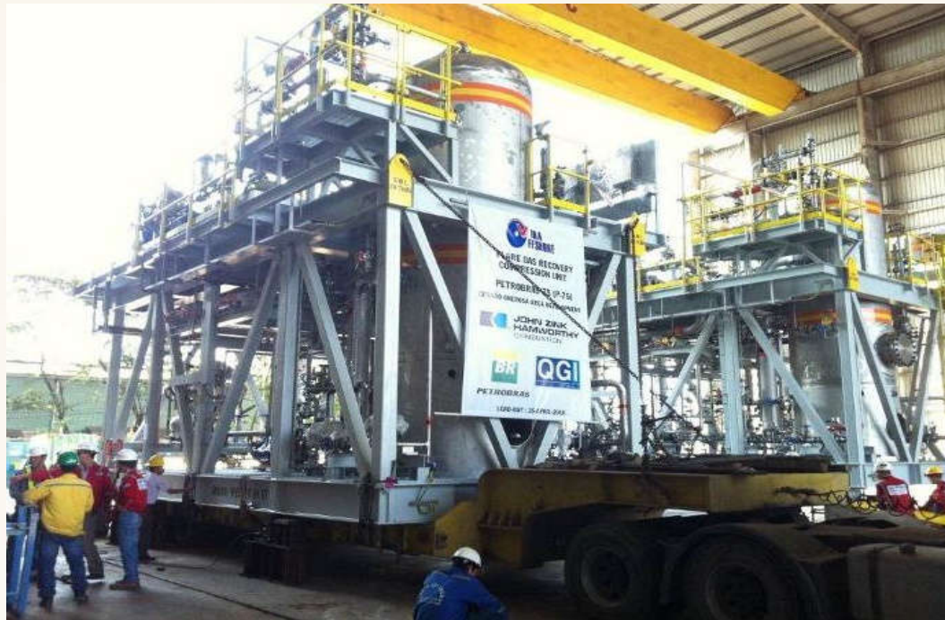
Flare recovery process skids for FPSO

Website: www.pps-inspection.vn Email: contact@pps-inspection.vn Phone: +84 918330685