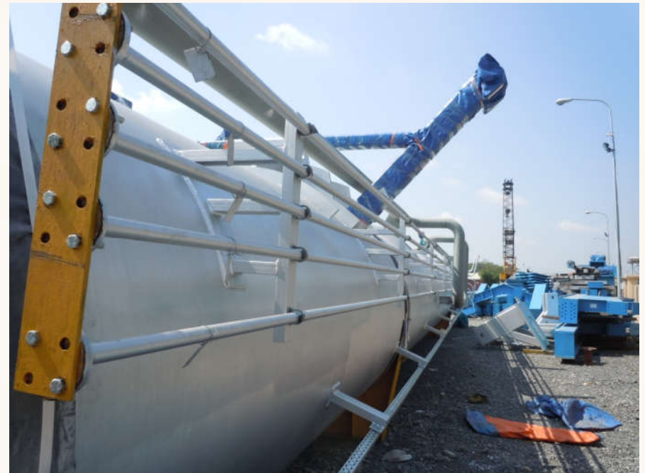
Flare risers for Refinery