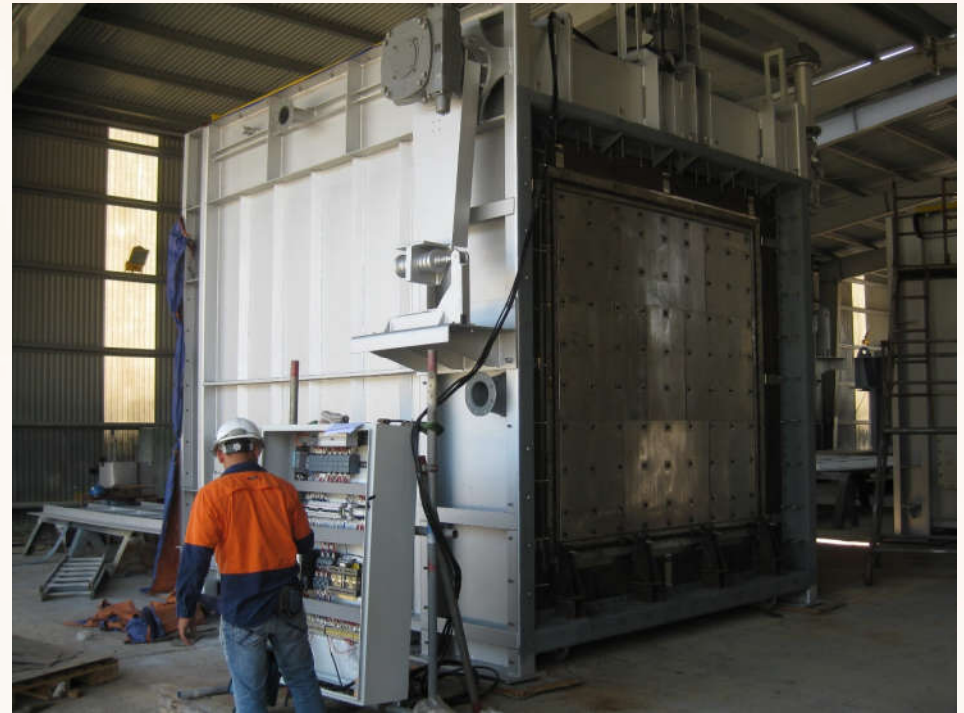
Diverter, Guillotine and Stack unit for Power Plant

Website: www.pps-inspection.vn Email: contact@pps-inspection.vn Phone: +84 918330685