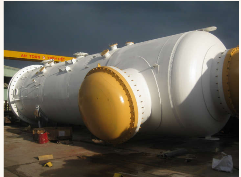
Liquid seal drum vessel for Refinery