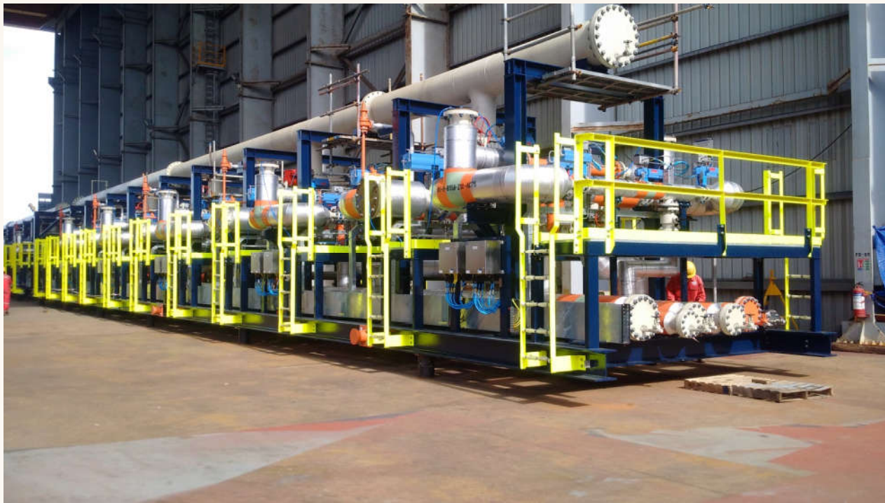
Piping process skids for Refinery