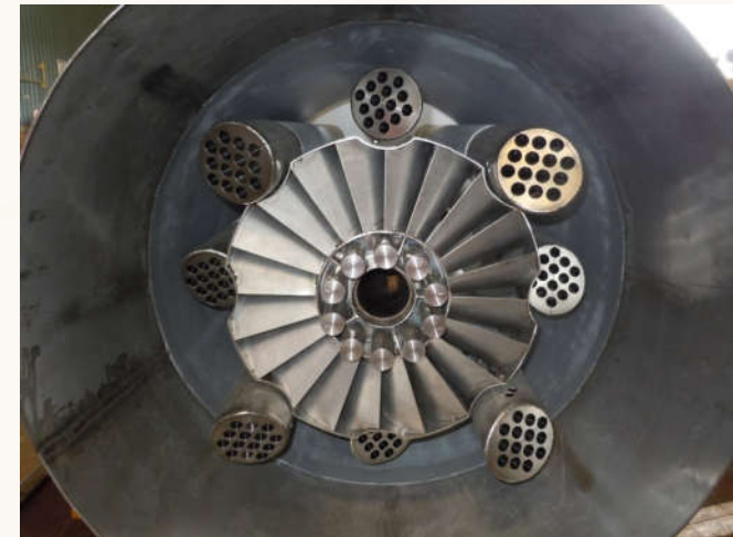
Burner and Accessories – Tip and Skids