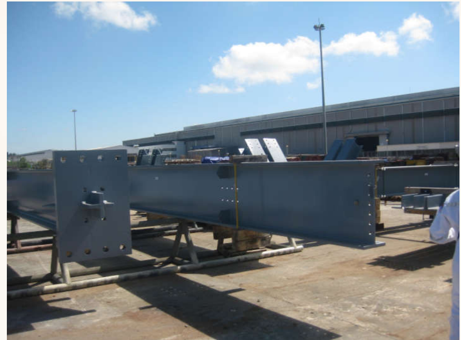
Heavy Steel structural for Geothermal Power Plant and Thermal Power Plant