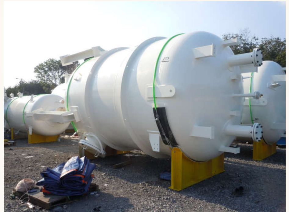
Pressure vessels for Vapor recovery unit for Refinery